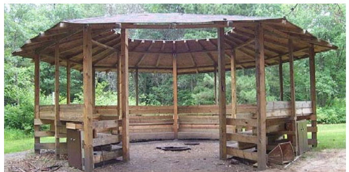
Council fire ring located behind the Observatory

Beaver Creek Reserve requests that all persons who use our site demonstrate respect for individual differences. Harassment on the basis of race, color, creed, gender, sexual orientation, disability, national origin or ancestry will not be tolerated. Adult chaperones are asked to intervene immediately to defuse any potential harassment. Contact Reserve staff if you need assistance.