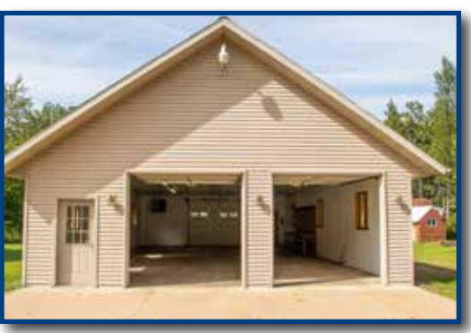
The large garage will make a great show and maker space for the Wildland's Students.

frustrating for the staff and students to share a building, we have to remember that this is due to the incredible success and growth of both the CSC and the Wildlands Charter School. Seven years