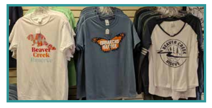
New T Shirt designs are in the nature store now!