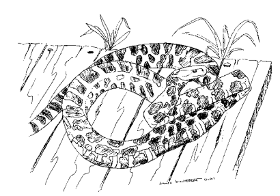
Fox Snake by Jim Schwiebert