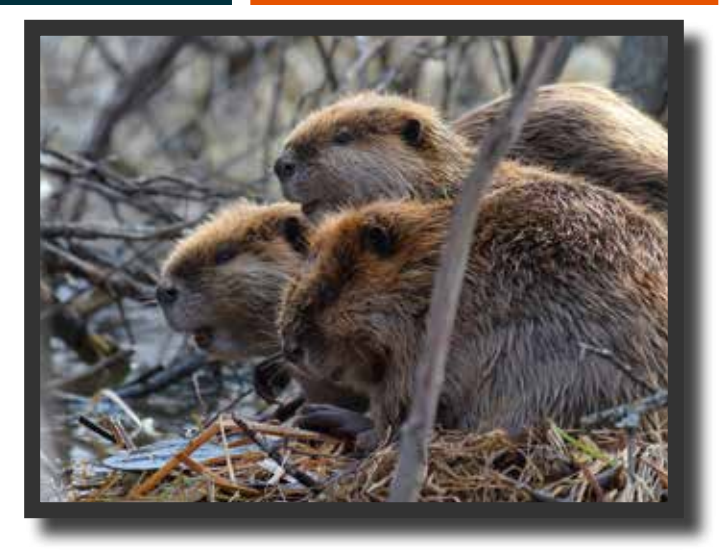
Best in Show 2019 - Beaver Family Time, by Scott Knight