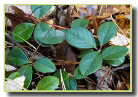
Wintergreen found at Beaver Creek.

Wintergreen is a woodland perennial that grows close to the ground, and in winter, is covered by a blanket of