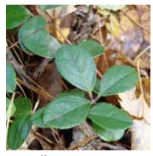
Naturalist Notes Pg. 6 Hiding under the Snow