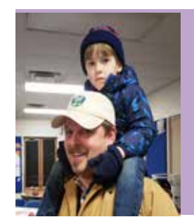
Director's Report Pg. 6