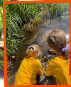
Little Explorers: Animal Investigation

Looking to guarantee your camper a spot? Sign up to volunteer! See Page 4