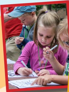
A Brush with Nature