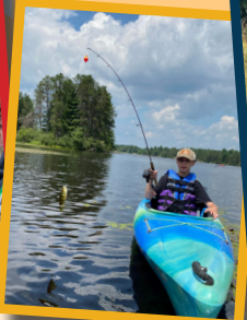
Outdoor Water Adventures