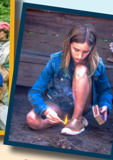
Expedition: Beaver Creek