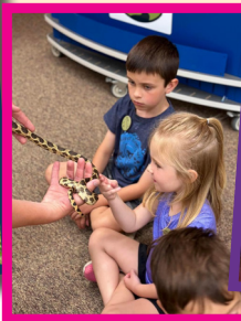
R is for Reptiles