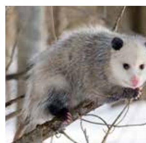
Naturalist Notes Pg 8