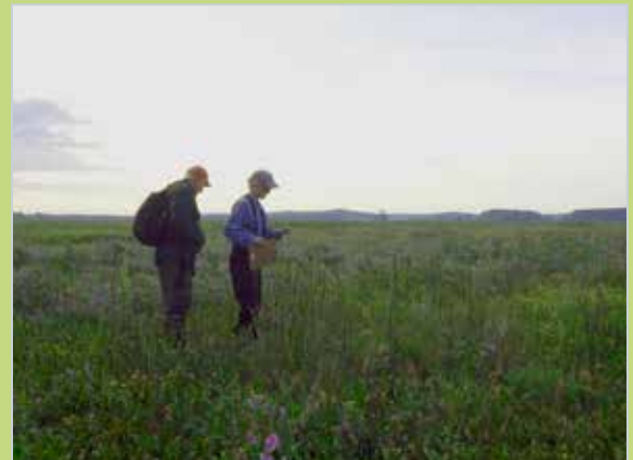
CSC Volunteers conducting a grassland bird survey.

The Tyrone Property is an ecologically significant, 991-acre parcel of land critical for declining grassland bird species. The National Audubon Society and the