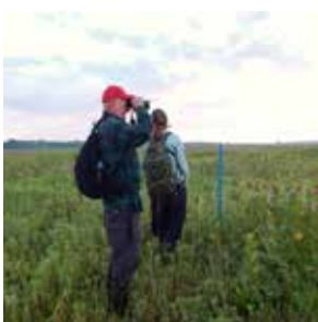
Grassland Birds Pg. 2