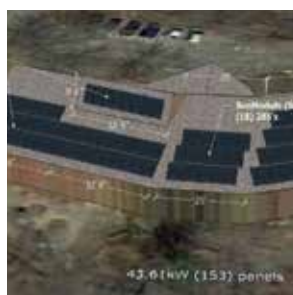
Director's Report Pg 3