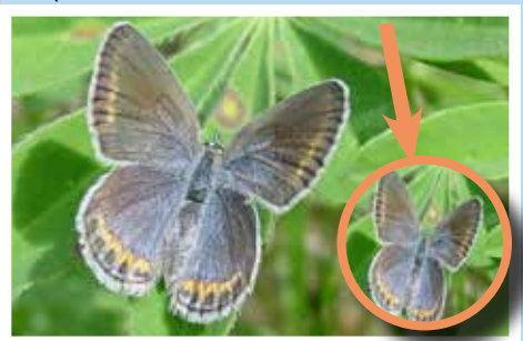
Karner Blue Female

(The Karner Blue's acutal size, is about the same as a nickel!