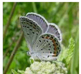
Butterly Blues Pg. 6 Learn more about the Karner