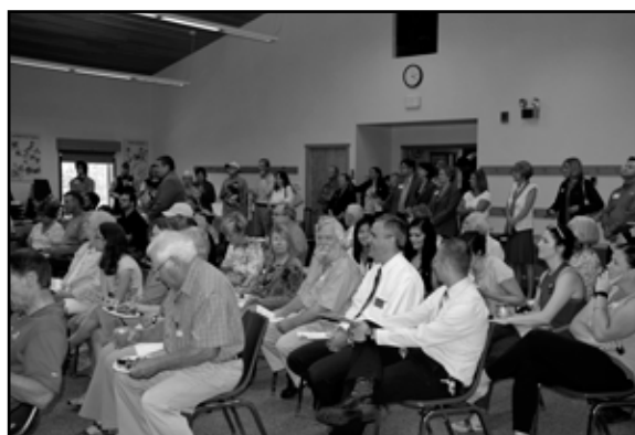
Nearly 200 people came to Beaver Creek to celebrate the Grand Opening of the Scheels Discovery Room.

The crowds were visibly pleased with the