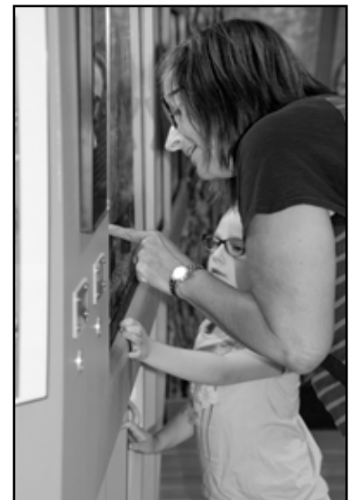
Guests were able to experience the new hands-on exhibits for themselves.

We cannot say thank you enough to everyone who donated time, money and talent to this project! If you have not had the opportunity to see the new exhibits first-hand, we heartily encourage you to do so!