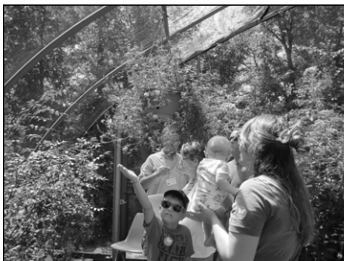
A record number of Swallowtails made for a particularly showy visit to the Butterfly House during Butterfly Fest.