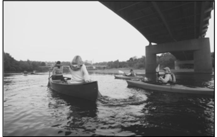
Conference Day 2, 2015

backdropforthe morning. All activities will begin in the Great Lawn at Phoenix Park, right at the confluence of the Eau Claire and Chippewa Rivers. Gather with your family and friends on shore to watch WDNR shock fish and bring them to shore for observation. Last year a 42 inch Musky made an appearance! Feel