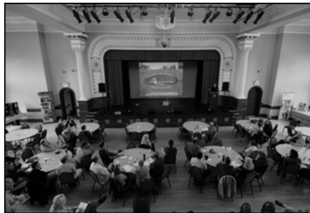
Conference Day 1 2015, Heyde Center for the Arts, Chippewa Falls.